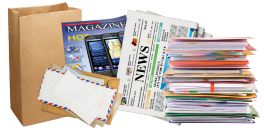
Junk Mail, Periodicals, & Office Paper (Paper bags, envelopes, & catalogs)