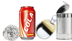
Aluminum & Steel Cans (Foil & empty food & beverage cans)