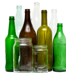
Glass Bottles & Jars (Empty food & beverage bottles & jars)