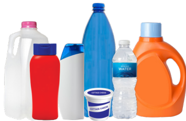
Plastic Bottles, Jugs, Tub, & Lids (Empty kitchen, laundry, & bath containers)