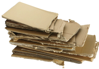
Corrugated Cardboard (Wavy center layer)