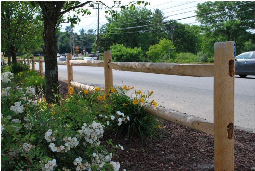
59 of 66 images

Fence will be a two-rail rough cut Post and Rail (example only)