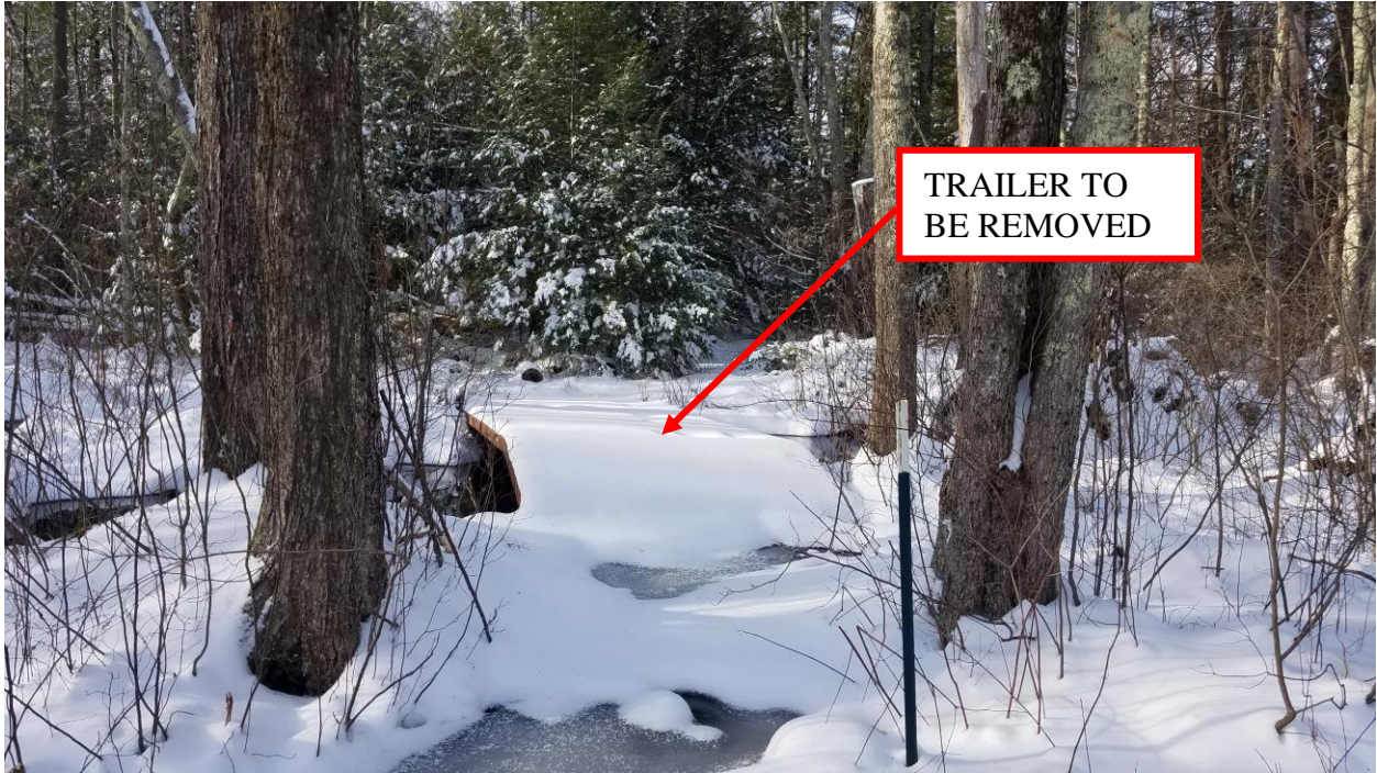
Looking southwest from the trail between the end of Hollywood Drive and the trailer.