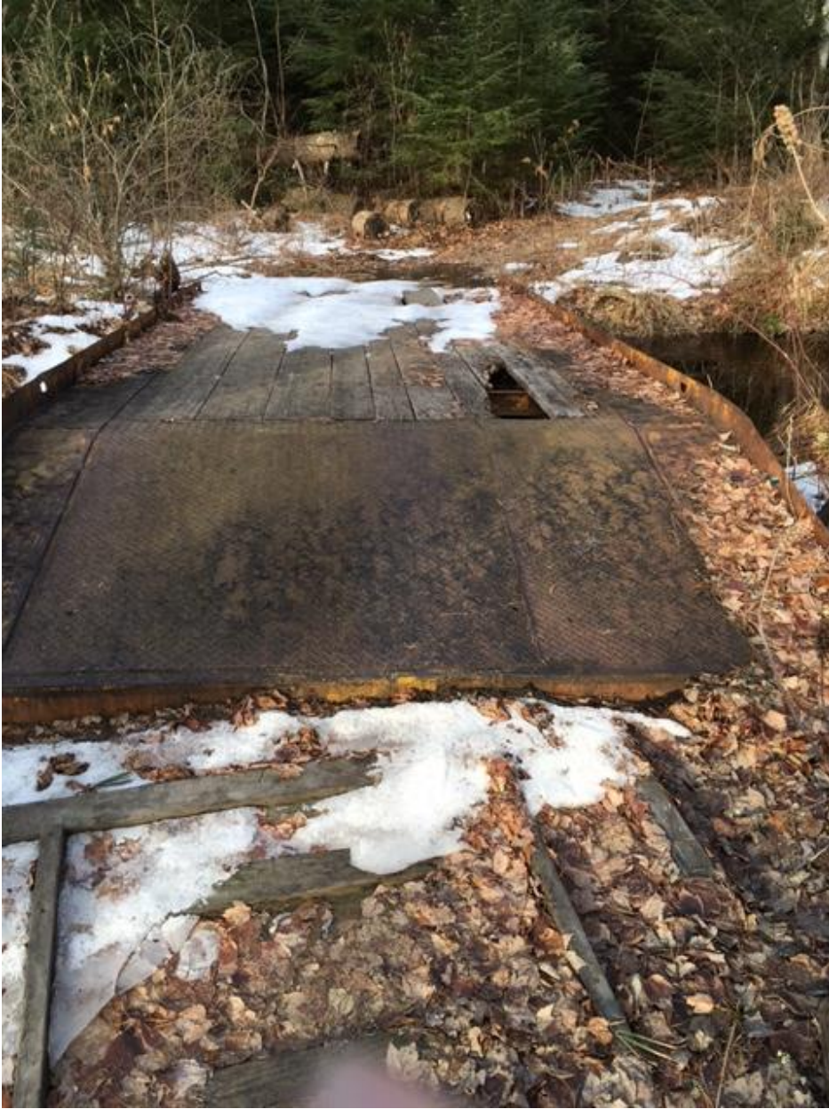
Trailer to be removed, looking southwest.