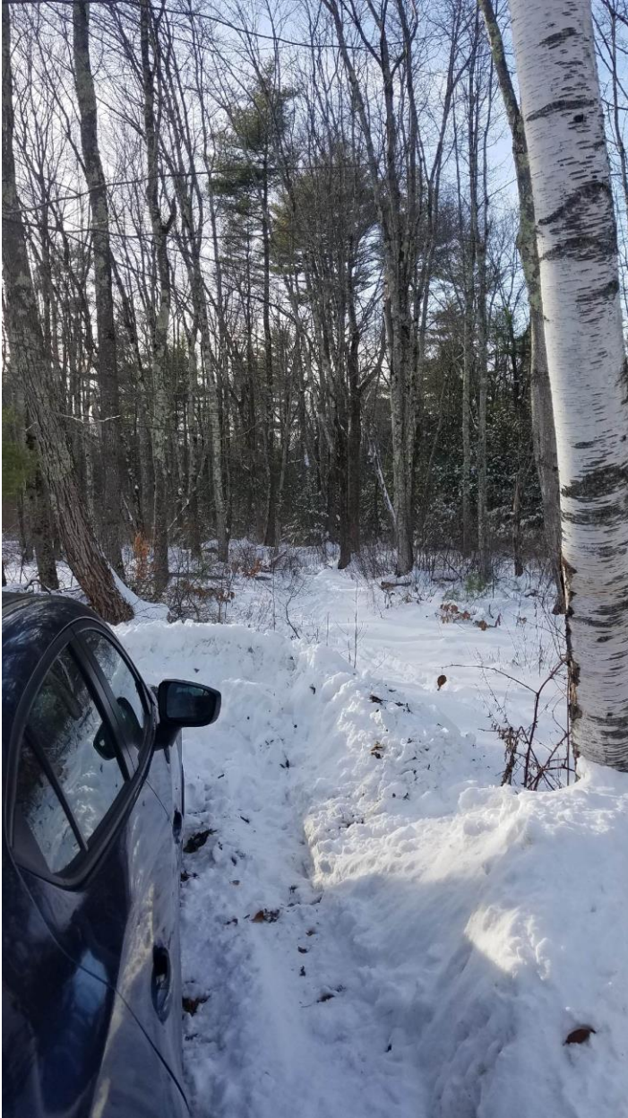
Looking southwest from the end of Hollywood Drive toward a trail leading to the trailer.