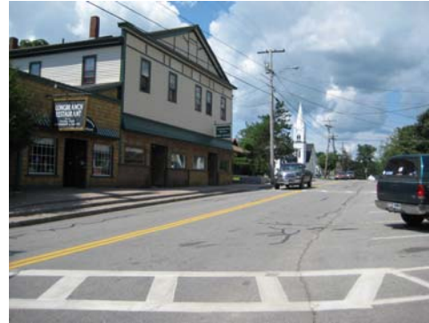
Main Street, Downtown Raymond

The program is sponsored by the Community Development Finance Authority and it offers a Downtown Resource Center for NH communities to use as a vital planning resource.