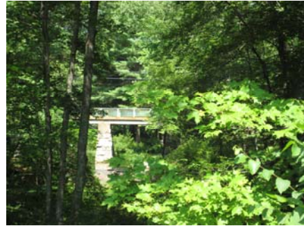
Dudley Road Stone Bridge

Historic preservation easements allow a property owner to grant a portion of the rights of the property to a group that commits to preservation. The property owner retains the right to sell the property, however all subsequent property owners forever relinquish the development, demolition, alteration, or other rights waived as part of the easement.