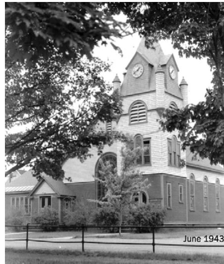
Raymond Congregational Church - Photo 1943 and 2009 Historic District Property