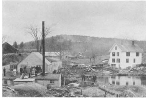
Healey Mill, in the vicinity of Onway Lake