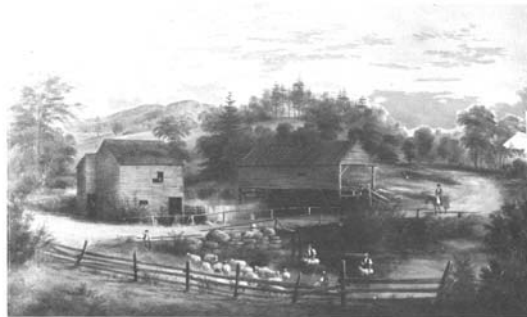
Dudley Mill in the vicinity of Dudley Road

In the 1800s, the roads in Raymond were improved and the railroad was built in 1852 running from Portsmouth to Concord. The new railroad helped bring prosperity to the Town of Raymond by becoming the central place for shipping timber. During the same period, the Town of Raymond developed its first real Central Business District area which is now the downtown village area; at this time, stores, hotels, and taverns were built. In 1892, a terrible fire struck the Town of Raymond. The extent of the fires included some of the parcels that are included in the Raymond Historic Overlay District. The fire spread through the area from the common south along the east side of Main Street to just south of the rail road tracks. Most of the development within the downtown area was destroyed by the fire but soon after the area was redeveloped. The majority of the buildings you see today in the downtown area were built in this time period. The 1892 fire encouraged the establishment of the Raymond Fire Department and various water companies shortly after the occurrence of the fire.