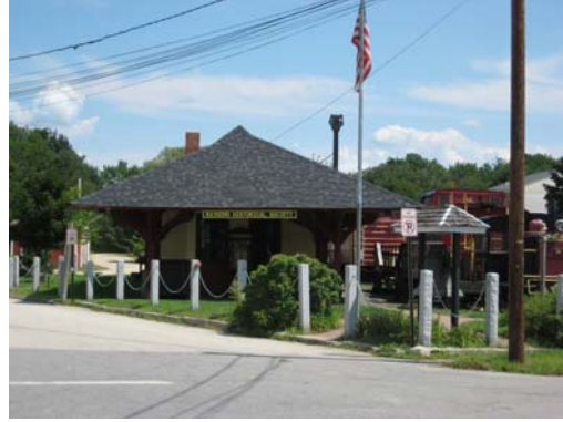
Restored Raymond Train Depot

As Raymond continues to grow in the future, there are a number of tools that can be effectively used to protect the community's historical resources both within and outside the existing Raymond Historical District zone. These tools are identified and discussed in the following sections.