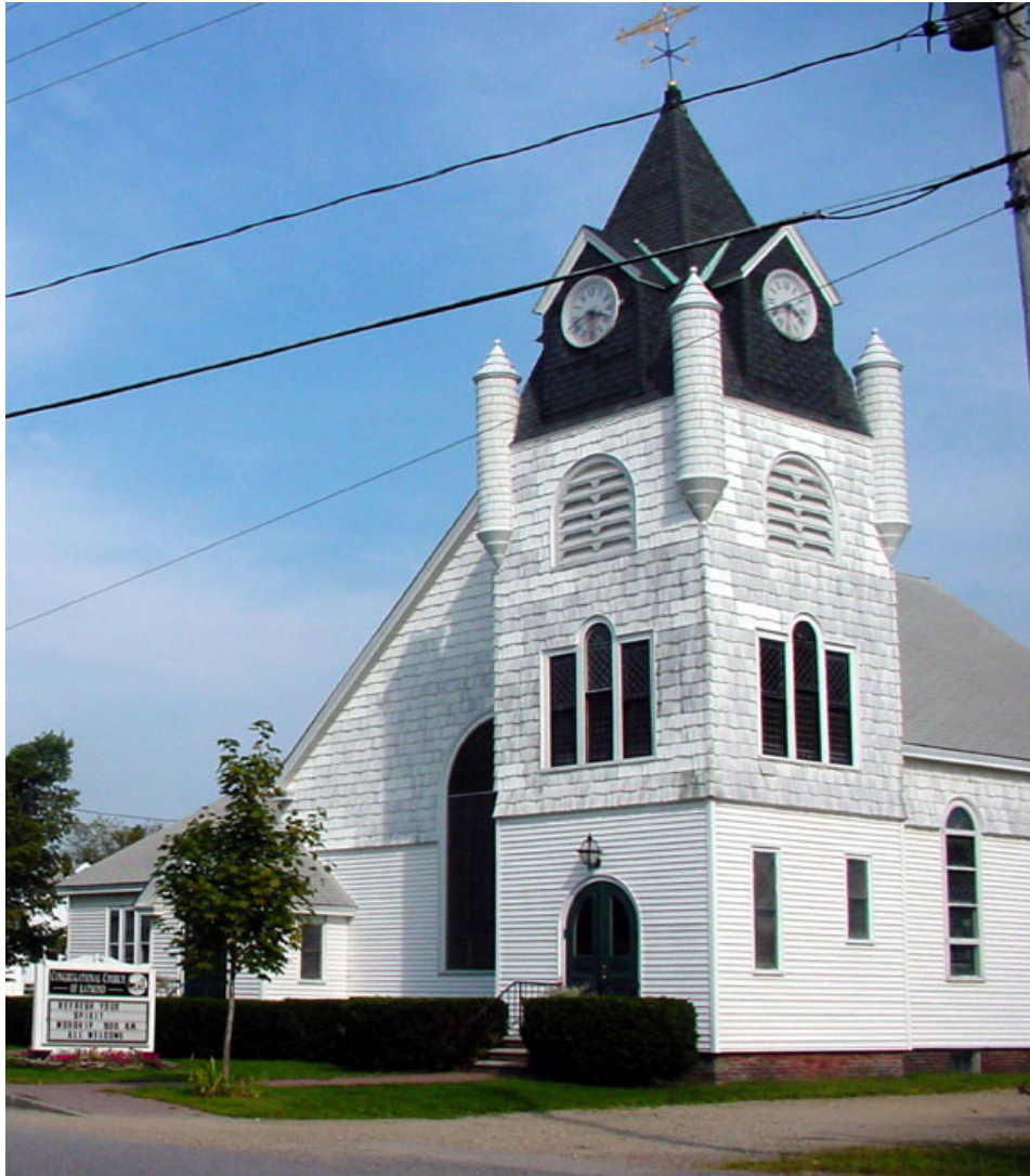
Historic Congregational Church Downtown Raymond, NH